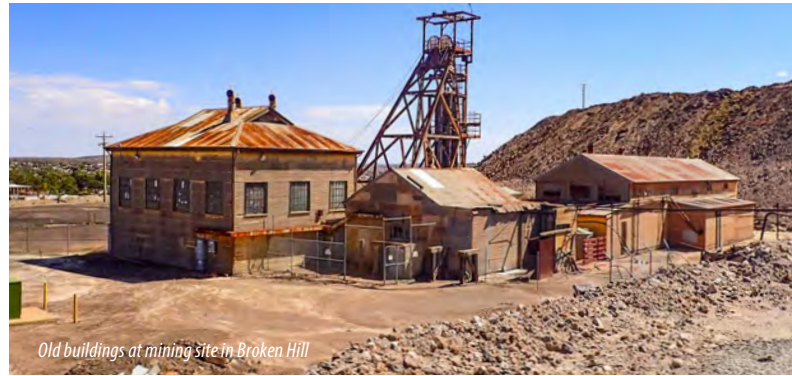
Old buildings at mining site in Broken Hill