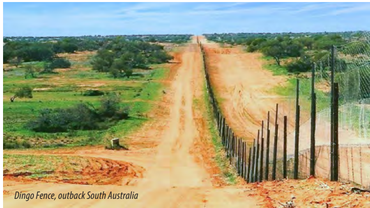
Dingo Fence, outback South Australia