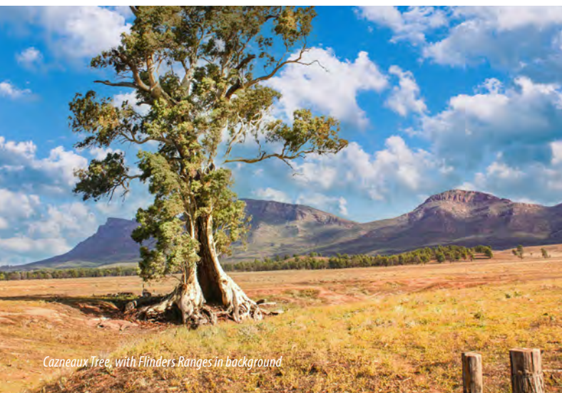
Cazneau's Tree, with Flinders Ranges in background

Travel to Wilpena Pound, via Marrabel, Burra, Peterborough, Orroroo & Hawker. In Burra (once a booming copper mining town) enjoy a tour of the town and sample one of the delicious local Cornish pasties (optional). Travel north to Wilpena Pound, in the spectacular southern Flinders Ranges. Near Wilpena Pound, see the Cazneau's Tree, subject of a famous photograph entitled The Spirit of Endurance , taken by Dick Smith's grandfather, Harold Cazneau, in 1937. Then proceed to Wilpena Pound, an extraordinary natural basin measuring approximately 14 x 7 kilometres. It's like a huge natural fortress, with only one entry point. Afternoon: You will have the opportunity of going on a sightseeing flight over Wilpena Pound (optional). Or, you might like to join John Howie for a walk into Wilpena Pound. Beautiful southern Flinders Ranges scenery. Evening: After dinner Brendan Scott will sing a few songs for us... a short, informal after-dinner performance! Overnight: Wilpena Pound Resort. (B,D)